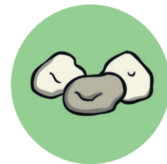
space rocks from the Moon