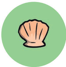
a shell from a mermaid