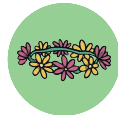
crowns from a fairy queen

What an exciting adventure with such wonderful discoveries!