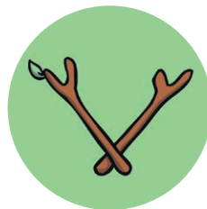
wands from a wizard