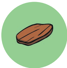
a scale from a dragon