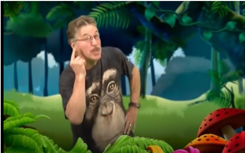
Party in the jungle - https://www.youtube.com/watch?v=KR-c0FXR9sA