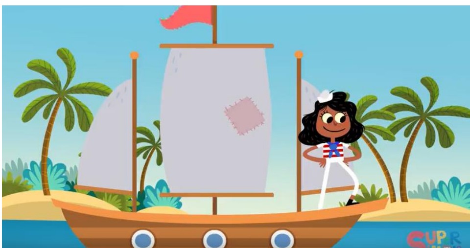
A sailor went to sea - https://www.youtube.com/watch?v=nFxAiWkSePk