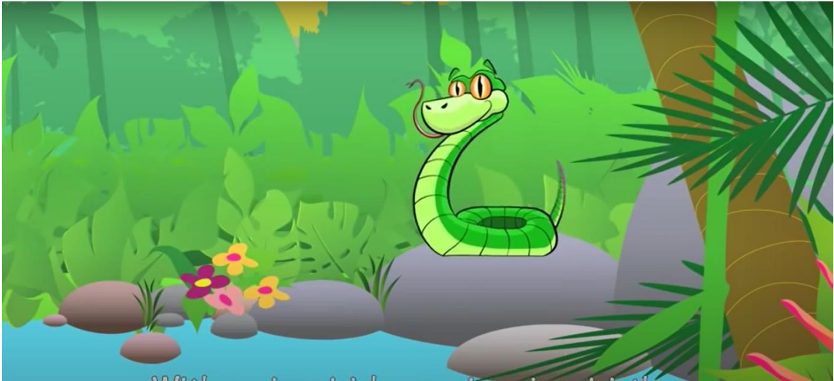
Down in the Jungle - https://www.youtube.com/watch?v=dFiqiQlHPwU