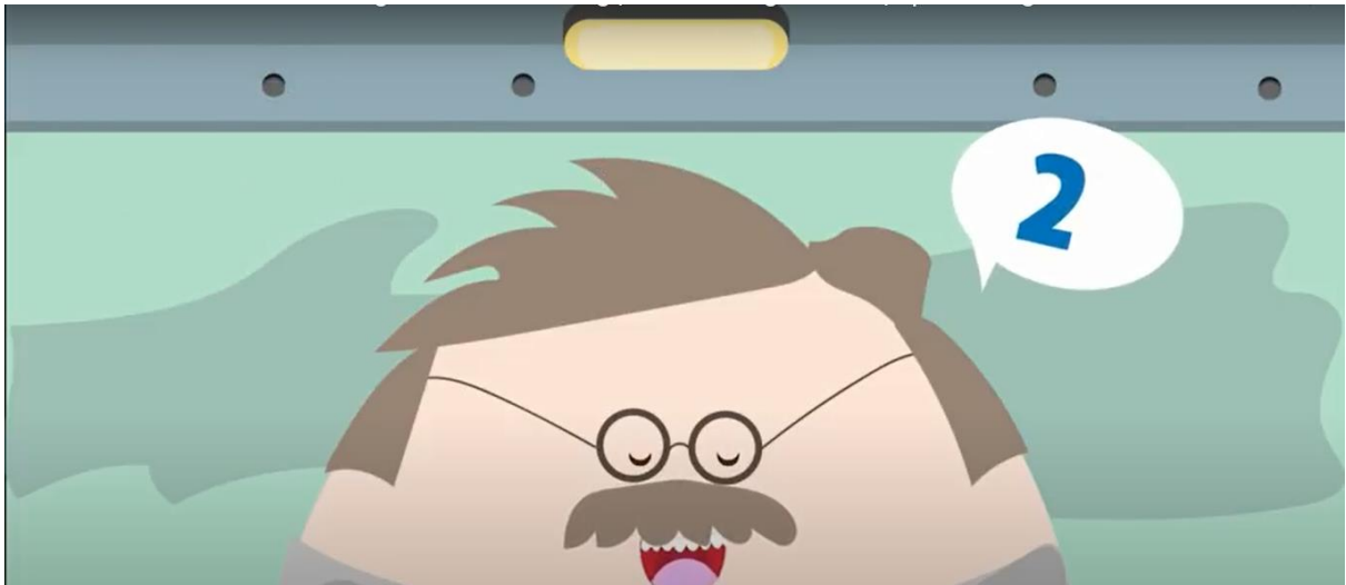
Zoom Zoom Zoom we're going to the moon - https://www.youtube.com/watch?v=Jn7uAsLWXpk