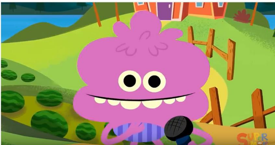
Down by the bay - https://www.youtube.com/watch?v=cAMbqRWqLXQ