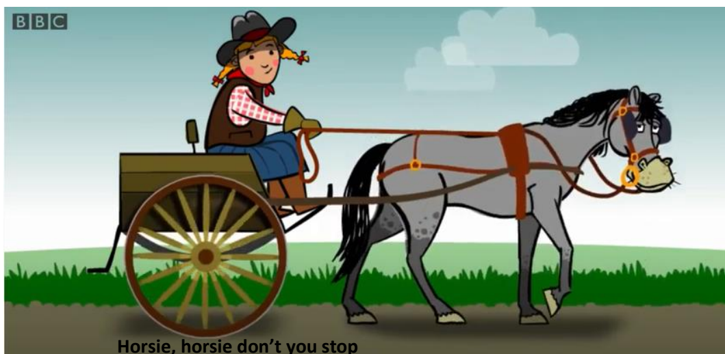
Horsie, horsie don't you stop