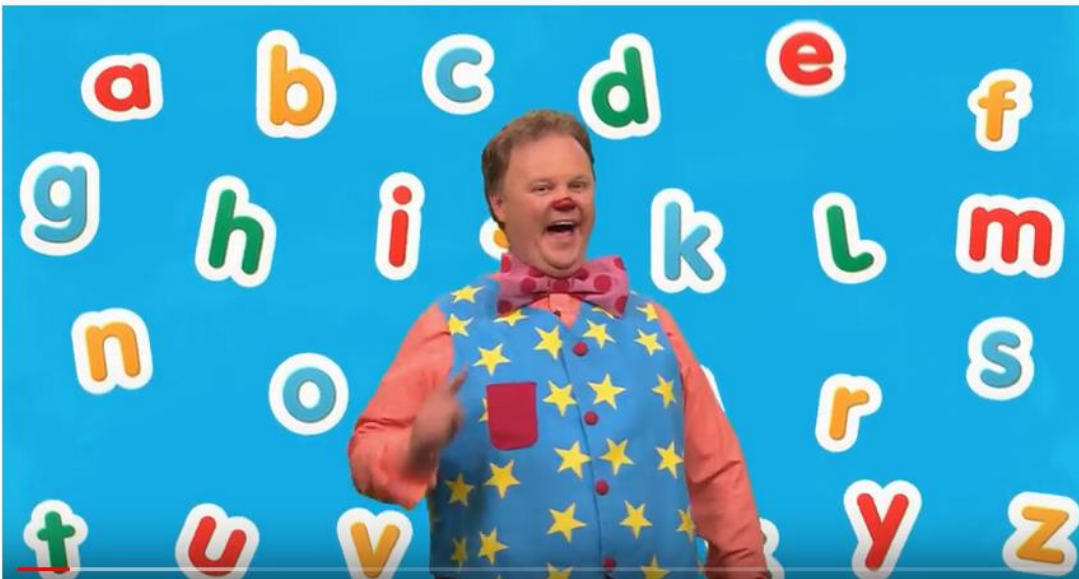
Mr Tumble's Alphabet Song - https://www.youtube.com/watch?v=mMog84sQp3o